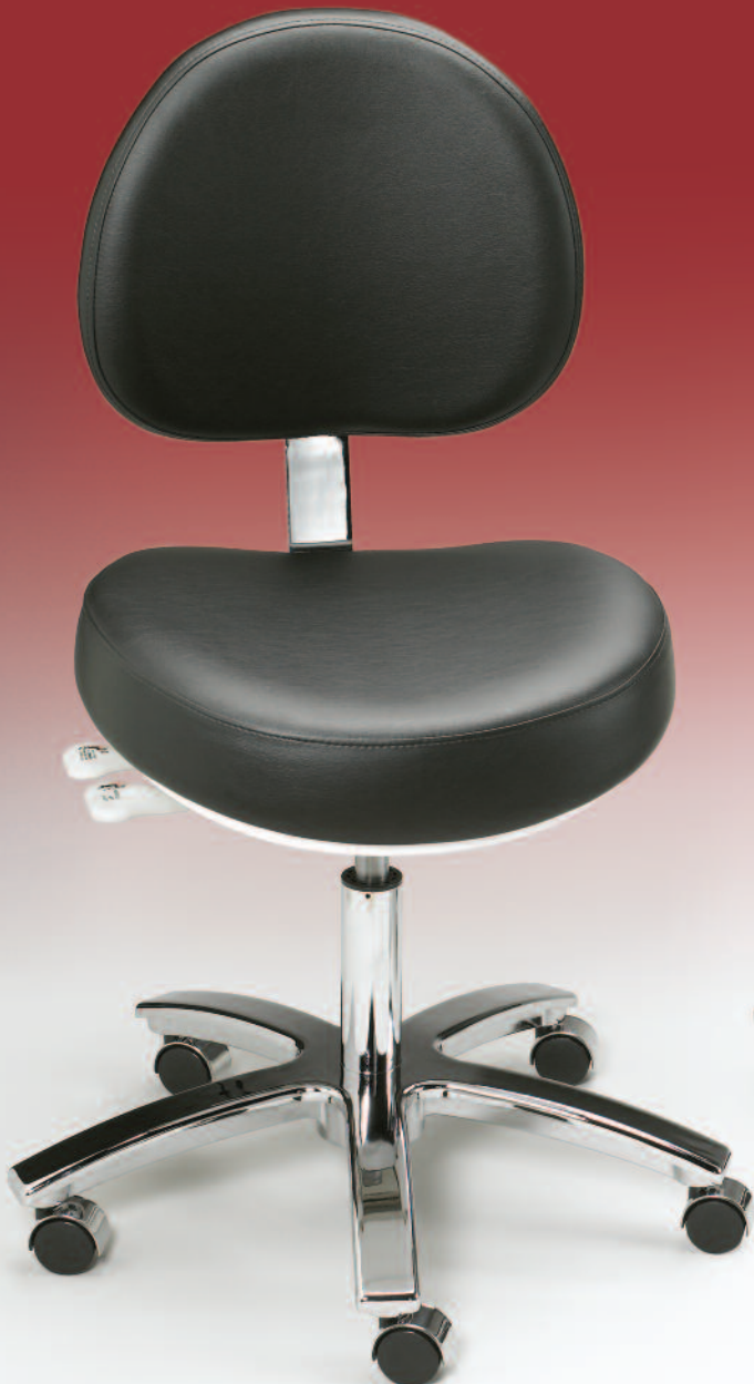
Model 101 Assistant's Memory Foam Stool