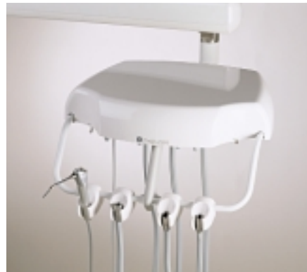
Handpiece holders are positioned for easy access and return of the handpieces