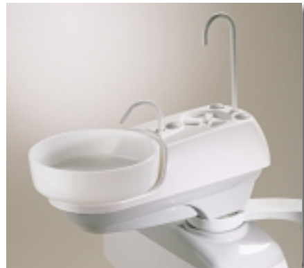
The Cuspidor is easily removed for daily cleaning and infection control