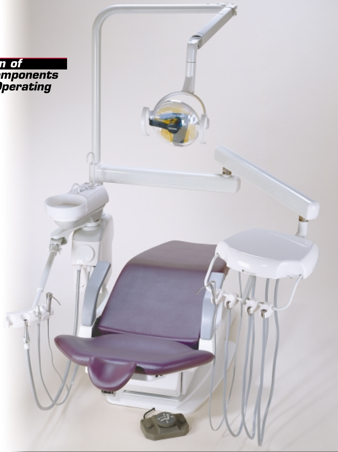
X-Calibur Dental Chair and Delivery System with the Clesta Light