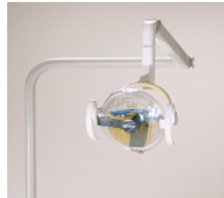
Clesta Light – seeing in the light of day