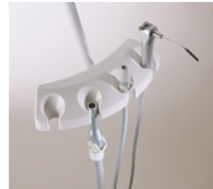
A swivel instrument holder for precise positioning