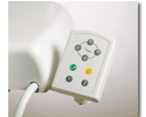
Chair activation using the optional touch-pad on the unit or the chair