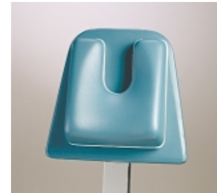
Optional flat headrest with vacuum formed cushion