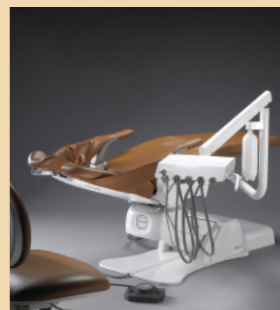
EDS-0575 L/R Doctor Control