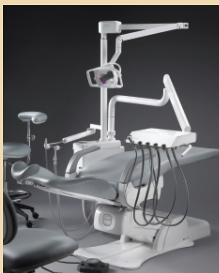
EDS-0510 Over The Patient Delivery with Telescoping Arm

EDS-0650 Left-Right Rear Mounted Hygiene Unit for Bel-50 Chairs