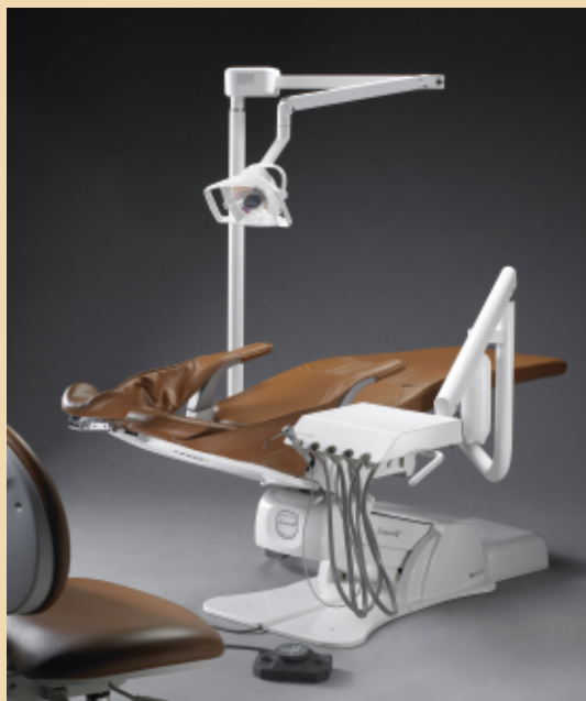
EDS-0570 L/R Doctor Control and L/R Light Post