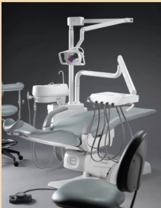
EDS-0500 Over The Patient Delivery with Cuspidor

ECO-Sys dental units are the perfect alternative for outfitting operatories when budget is a concern and quality is a must