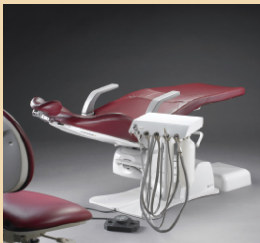
EDS-0650 L/R Rear Mounted Hygiene Unit

EDS-0500 Over The Patient Delivery with Cuspidor, Assistant Instruments & Light Post