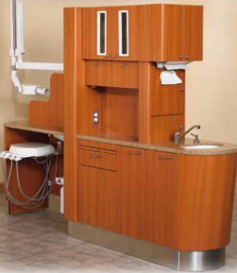
D-4R The D-4R with optional privacy panel, model 096 BelRay™ X-ray and BDS-2555 side delivery unit.