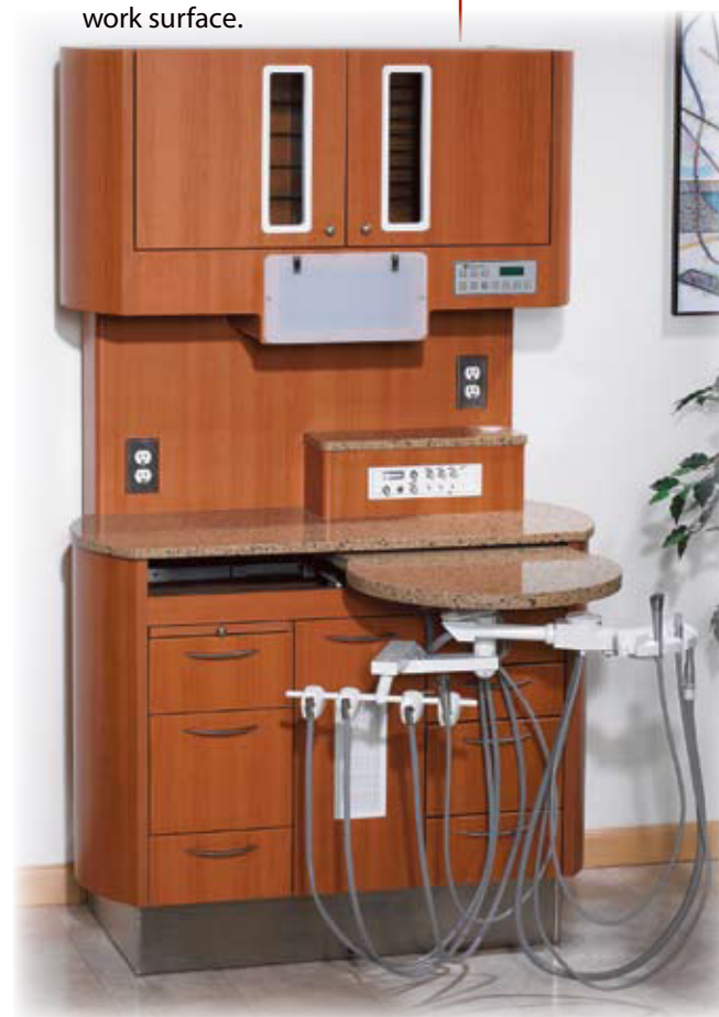
D-66CM The D-66CM shown with BDS-2561 unit mounted to multi-directional sliding work surface.