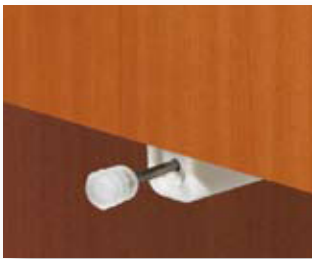
Door noise reduction system