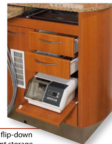
Optional flip-down equipment storage.