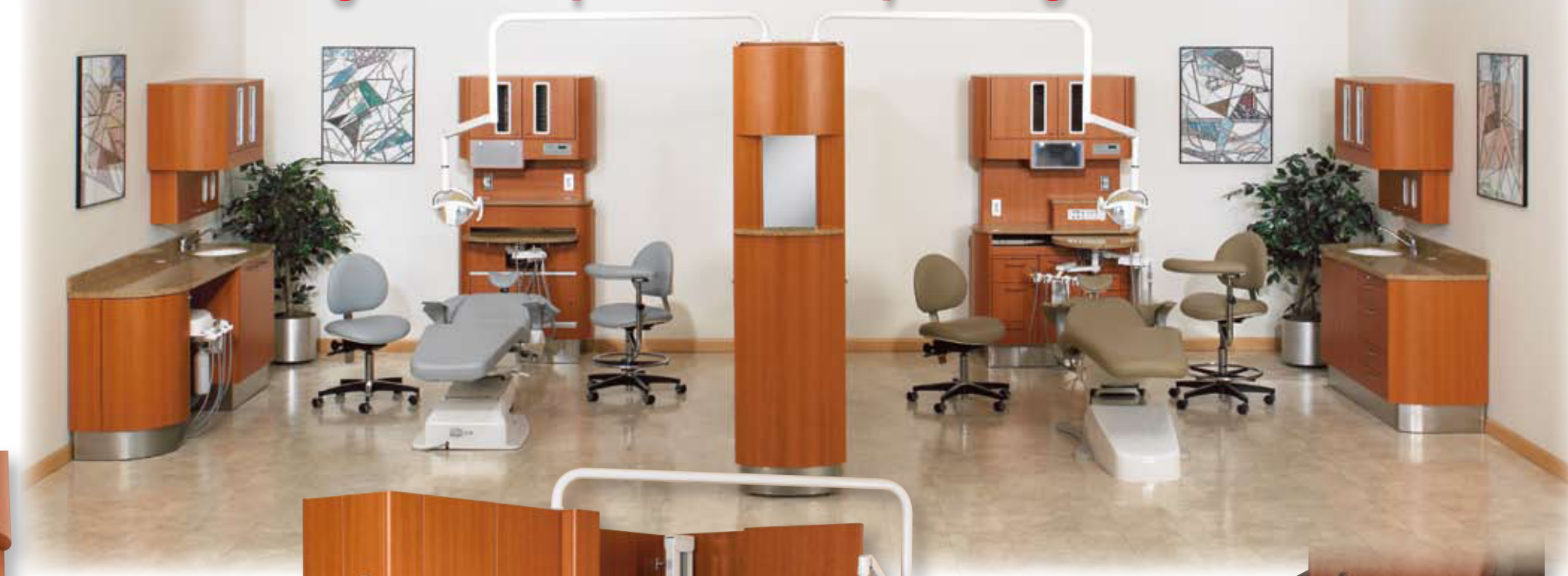
D-4RH Optional bi-fold doors conceal X-ray compartment that is accessible from both sides. Shown with 507N Clesta ™ light and model 096 BelRay ™ X-ray.