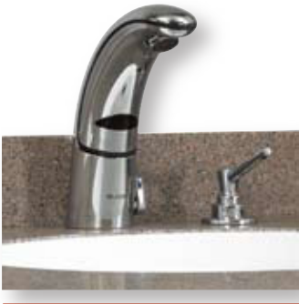
Optima® sensor activated electronic faucet