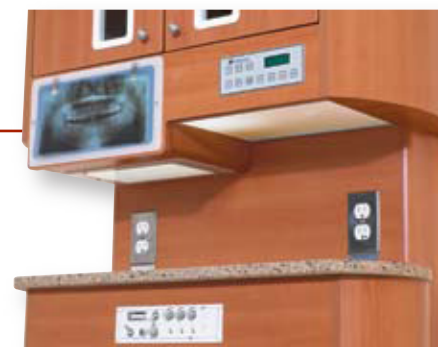
Task light diffuser panel eliminates shadows.