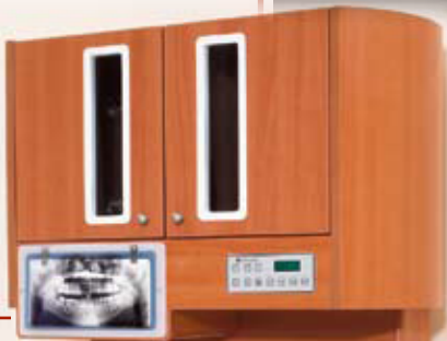
D-5CM The D-5CM shown with BDS-2561 unit mounted to slide-out work surface.