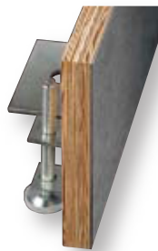
Marine grade plywood base with stainless steel facing