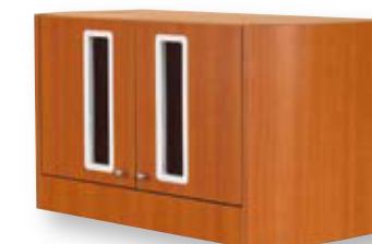
Wall Mount Storage D-2U Upper section D-2L Lower section D-2 Upper/lower section