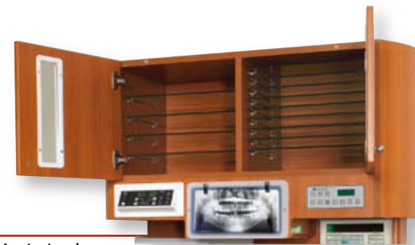
Maximized upper storage with 14 tempered glass shelves. Front fascia design enables total utilization of technology.