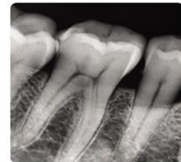
Sample Image Taken with iRay D3 & Rex Sensor

*Stand arm and Wall Power Outlet cable sold separately