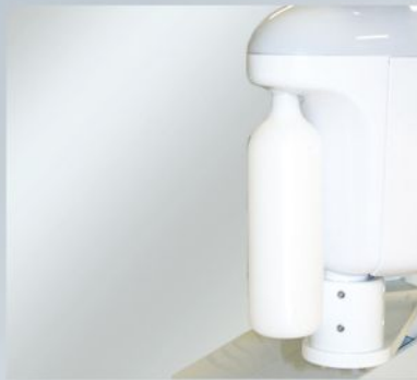
Built in self contained water bottle system including city/bottle selector switch.