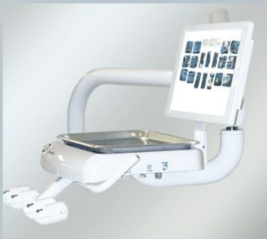
Optional: Super thin xray viewer mounted to unit head.