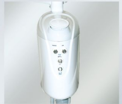
Built in air and water quick disconnect for ultrasonic scaling and prophy jet.